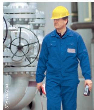
Dräger X-am 3000: All menu functions on one level.